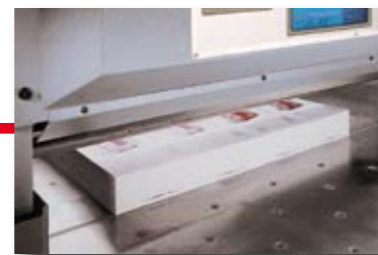
Before the cut: The material is placed in position. The front table is still closed.