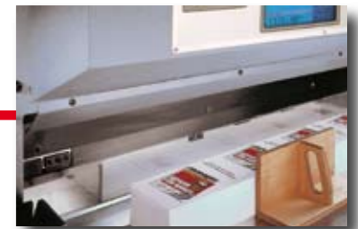
The first batch has been cut and is lying on the front table. The TrimmMaster is ready for the next cut.