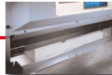
The waste removal process is activated. The front table is opened and the plexiglass plate is lowered.