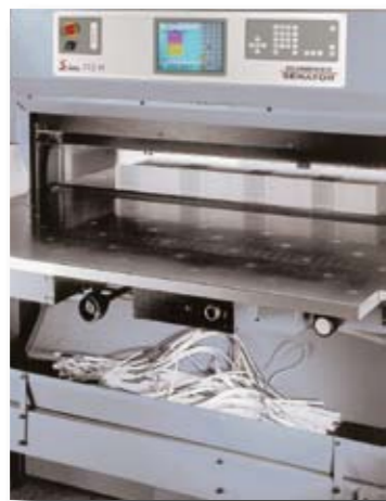
Senator TrimmMaster: Fast waste removal thanks to the front table opening.