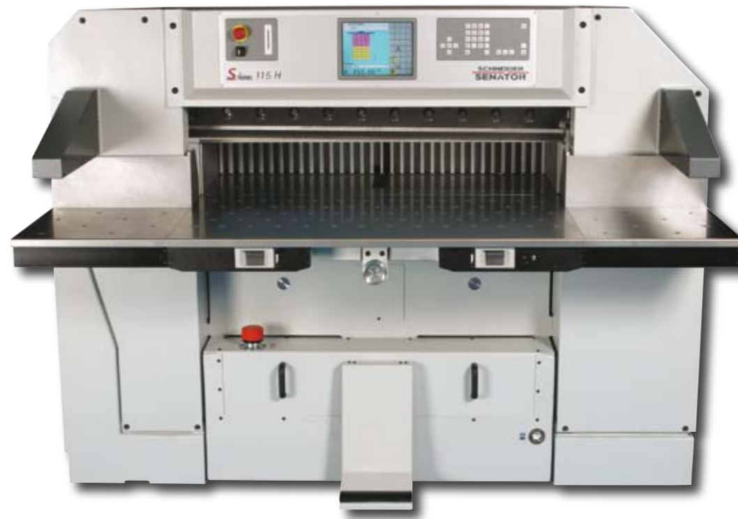
Ideally suited for the optional TrimmMaster System: the fully-hydraulic Senator S-Line 115 H.