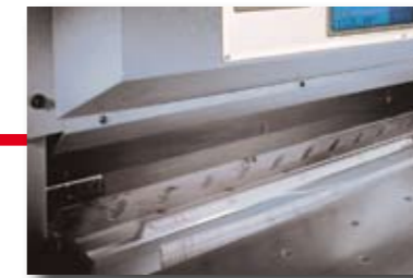
Cut - the waste paper falls into the gap.